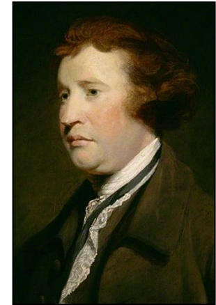
Edmund Burke (NPG 655)

Mount Burke, 1270 metres (4,167 feet), is a mountain located in the northeast of Coquitlam, north of Port Coquitlam, on the ridge system leading to 'Coquitlam Mountain'. Most of the mountain is part of 'Pinecone Burke Provincial Park'.