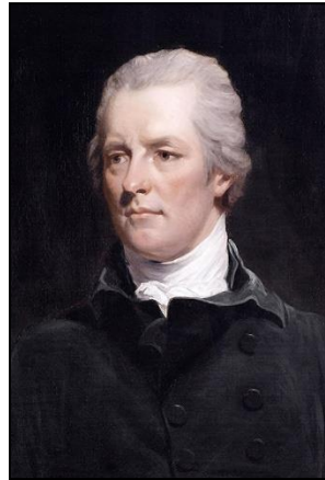
William Pitt "the younger"

The 'Pitt River' was named for William Pitt "the Younger" (1759–1806). The first mention of the name, as "Pitt's River", occurs in the 1827 journal kept by James McMillan of the 'Hudson's Bay Company'. The river also has an alternate name, 'Quoitle', which is probably equivalent to 'Kwantlen'.